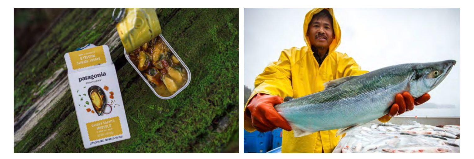
Smoked Mussels PAT-11300 10 / 4.2 oz